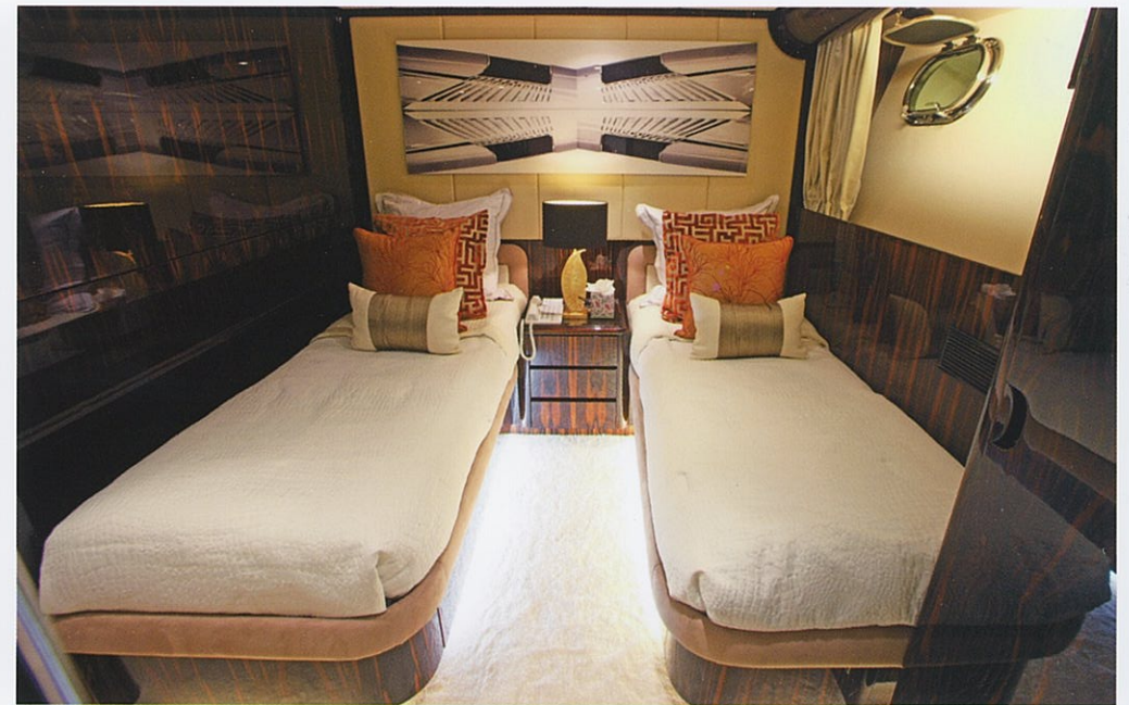
TWIN CABINS - Two twin cabins, each with a Pullman bed and all with ensuite facilities and entertainment centres.