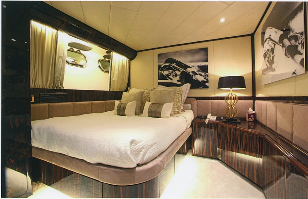
DOUBLE CABINS - Two double cabins, one of which has a queen-sized bed while the other has an extra Pullman bed, both with ensuite facilities.